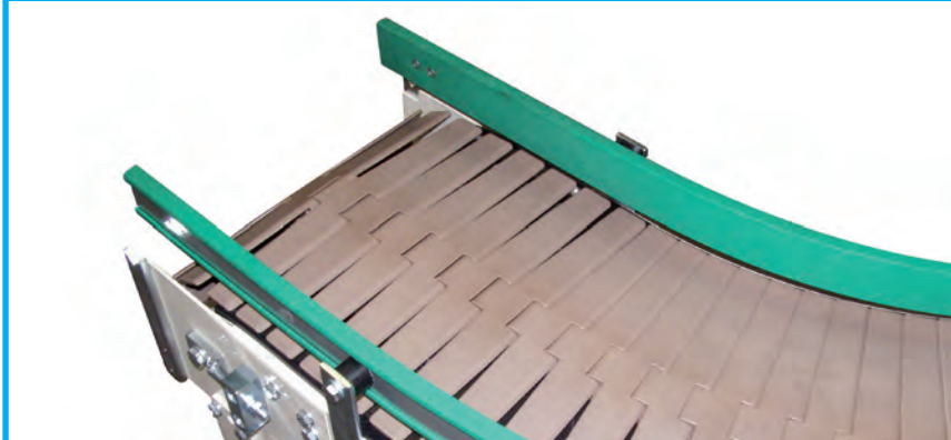
Table-top conveyors width are fixed and there are choices in relation of handled product type (150, 200, 250 and 300 mm).